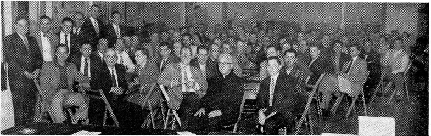
The Campaign Committee of St. Albert the Great Church Building Fund is pictured here at their most recent meeting. The Continuation Committee is represented here and will begin calling on the parishioners this week.