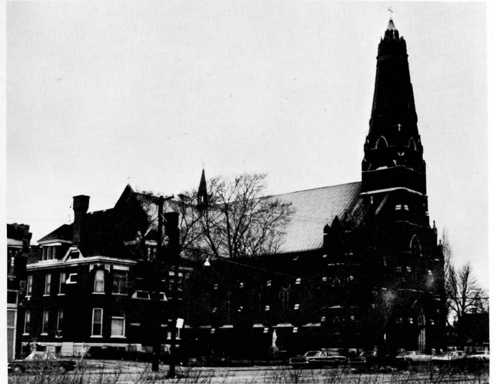
ST. ALBERTUS CHURCH