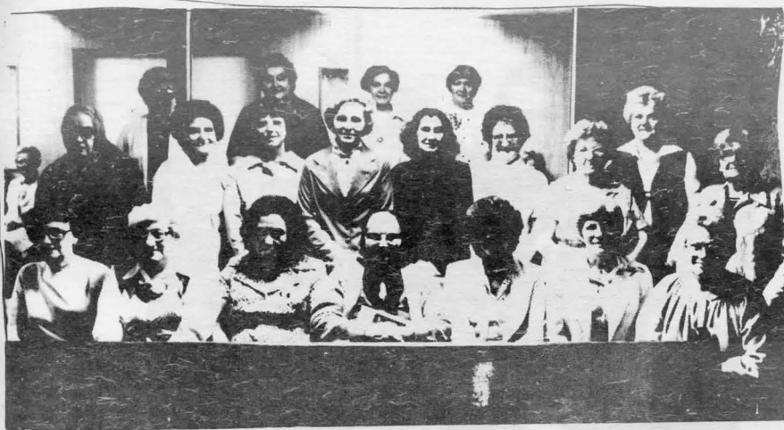
Rosary Society Group